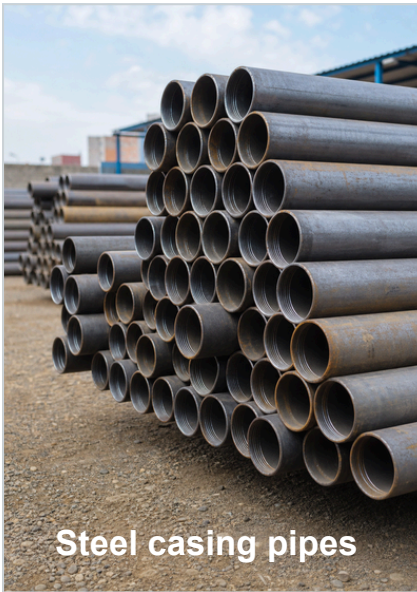
Steel casing pipes